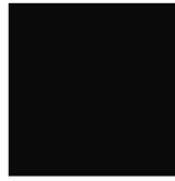
NERO CL. I RAL 9005