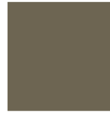
TORTORA RAL 7006