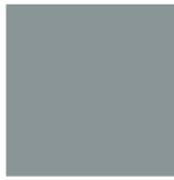
CELESTE RAL 7001