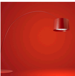
Twice as Twiggy