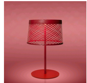
Twiggy Grid XL