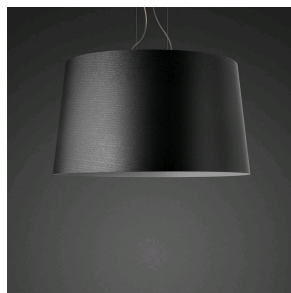
Twice as Twiggy