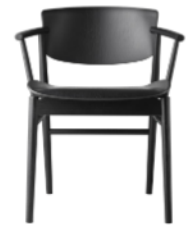
BLACK COLOURED OAK