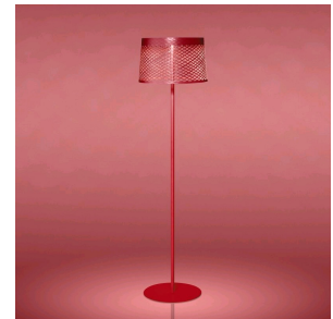
Twiggy Grid Lettura